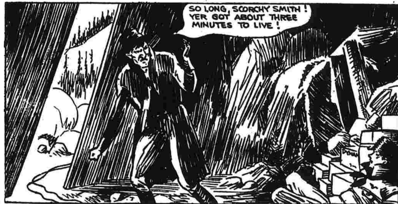
WASHINGTON TUBBS II By Crane