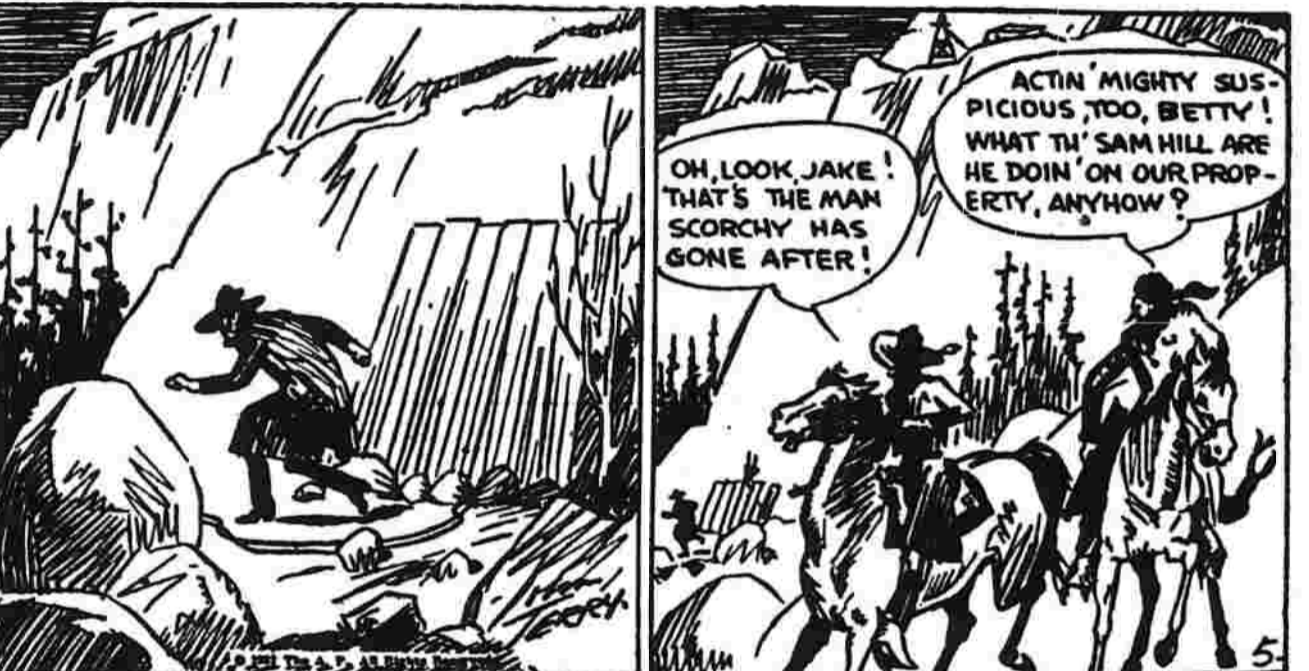
TEMPTATION.